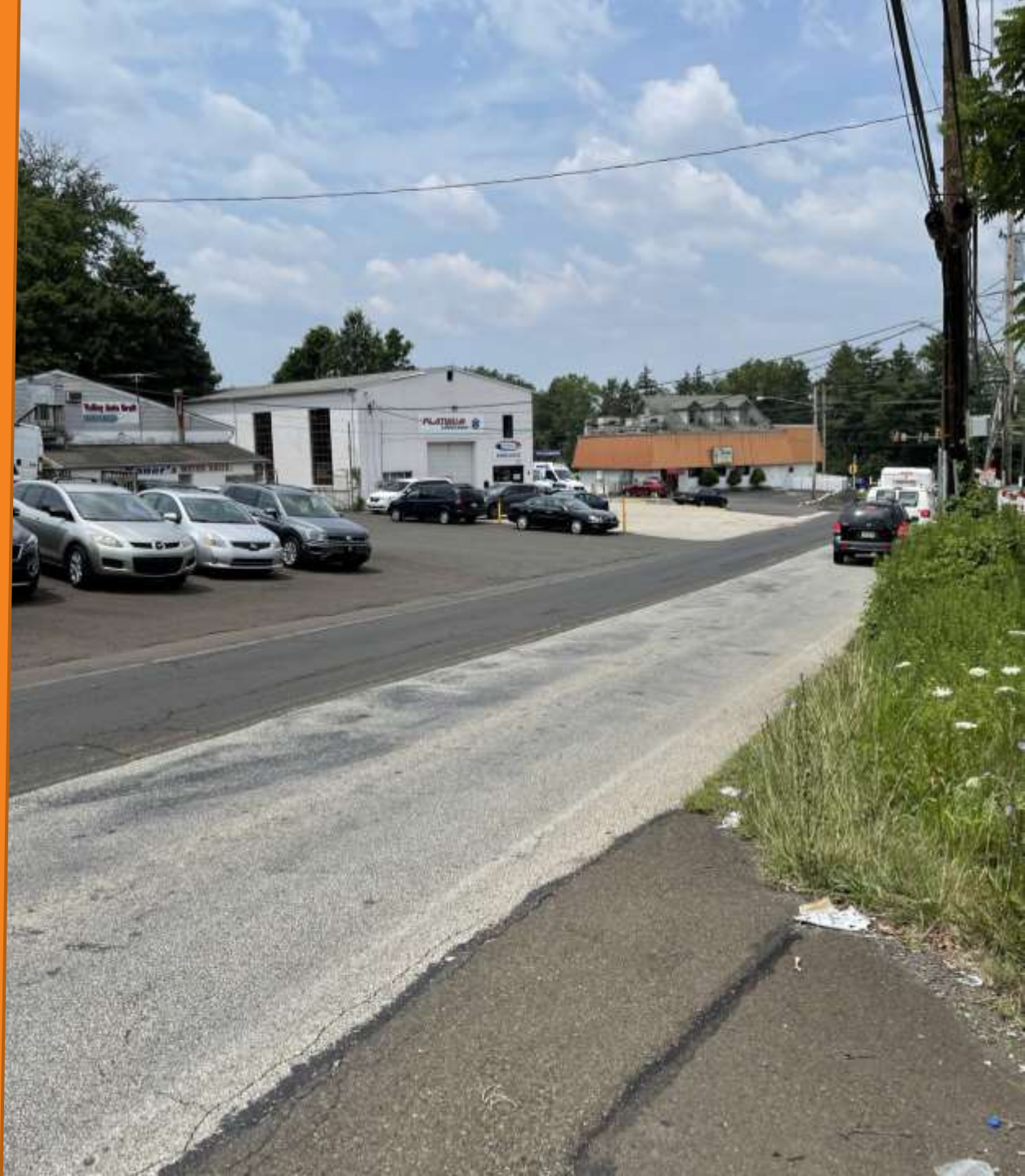
▶ TOMLINSON RD