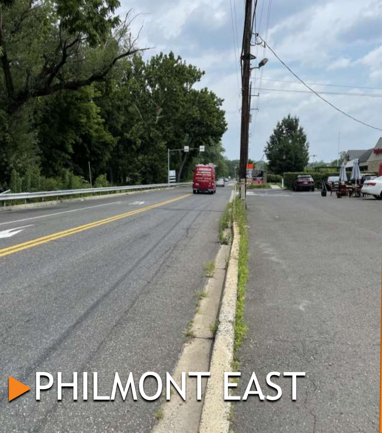
▶ PHILMONT EAST